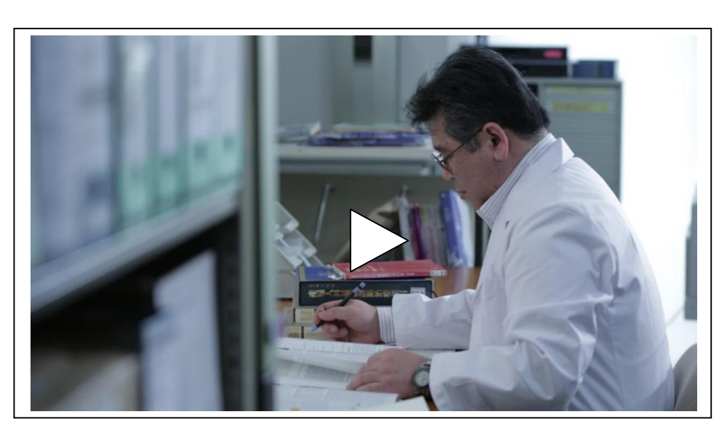
Click to watch how Otsuka researchers worked for nearly two decades to create a unique product to enhance the quality of life for aging women

EQUELLE is a processed food made with lactic acid bacteria from fermented soy germ containing equol. Equal, produced from a soy isoflavone, especially daidzein, in the intestine is known to act like an estrogen. But only around 50% of Japanese women and 30% of European and American women have the capacity to produce it. It is important to all women to continuously take equal to maintain and improve health.