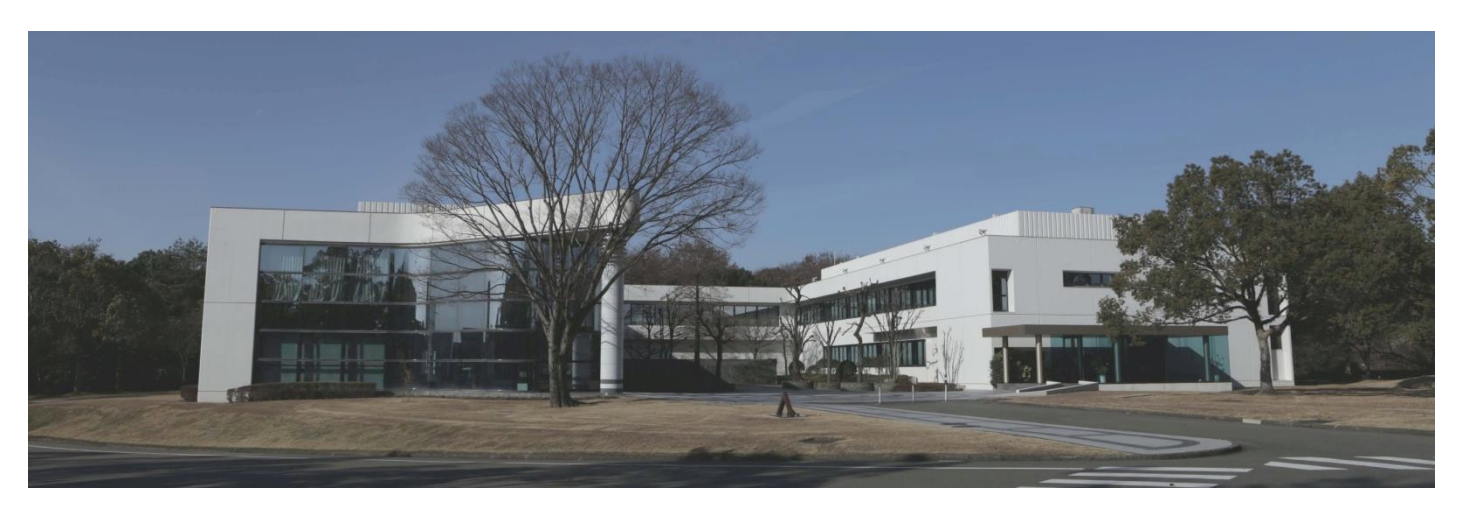
Saga Nutraceuticals Research Institute, Otsuka's Research Center for Nutraceuticals

For many years of soy research, Otsuka Pharmaceutical has focused on the relationship between equol and psychological and physical changes in menopausal women. In 2002 the Lactococcus 20-92, which produces equol, was successfully isolated. Both the Pharmaceuticals Business Division and the Nutraceuticals Business Division have conducted a range of research in both Japan and the U.S. into the safety and efficacy of equol produced using this lactic acid bacterium to ferment soy germ (natural S -equol).