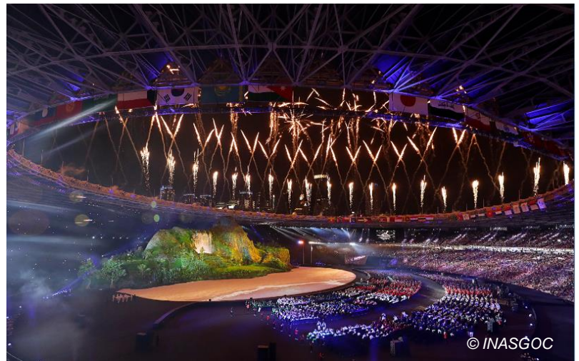
The 2018 Asian Games opening ceremony

This was the second time for Indonesia to host the Games, and the first since 1962. With a presence in Indonesia since 1974 and having introduced POCARI SWEAT to the country in 1989, Otsuka has a long history of partnerships with the local community. Having the opportunity to participate in such a major regional event was a highlight for all company employees involved.