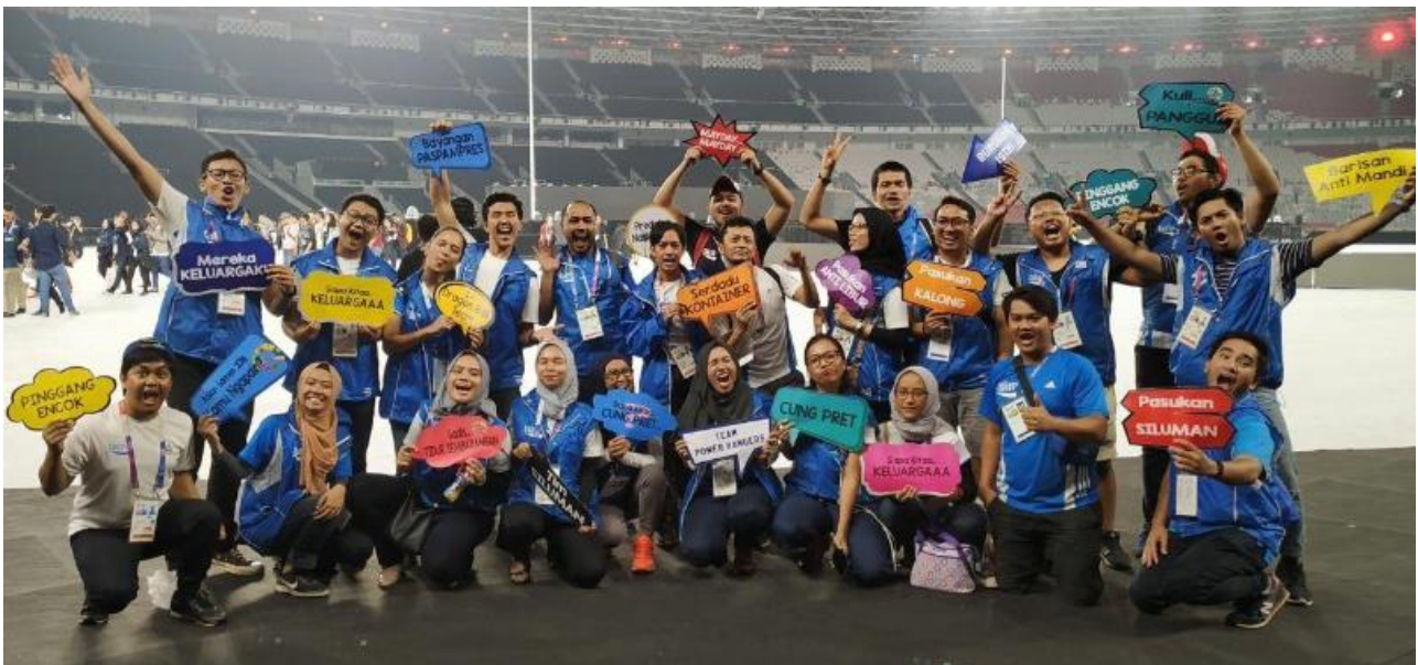
Otsuka's staff celebrate the success of their participation in the Games

Otsuka is committed to continuing to contribute to the growth and development of Asia through the development of scientifically-based products, the sharing of research findings, and participation in events such as the Asian Games.