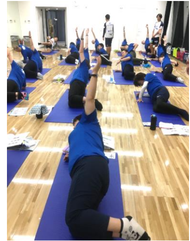
About the program

A total of 1,800 members of the public will participate in the program over the next five years. Participants will attend weekly group training sessions with Tokushima Vortis coaches for eight weeks, as well as exercising at home at least once a week. The program will introduce the participants to a new exercise routine, and all daily physical activities will be tracked using a wearable device. The hope is that the program will help alleviate physical problems often suffered, such as those related to the hips, joints, and overall posture.