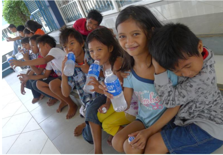
POCARI SWEAT was invaluable in the displaced people's treatment of dehydration and other illnesses where oral rehydration was essential

On November 8<sup>th</sup>, 2013 the strongest typhoon that hit the earth landed in the Philippines. Typhoon Haiyan's wind strength at landfall beat out Hurricane Camille's, which were 305 km-per-hour winds (190 miles-per-hour winds) at landfall in the US in 1969. The aftermath was devastating, with 6,166 deaths as of January 3<sup>rd</sup>, 2014 (National Disaster Risk Reduction and Management Council), 28,626 injured, 1,785 missing and 4 million people displaced.