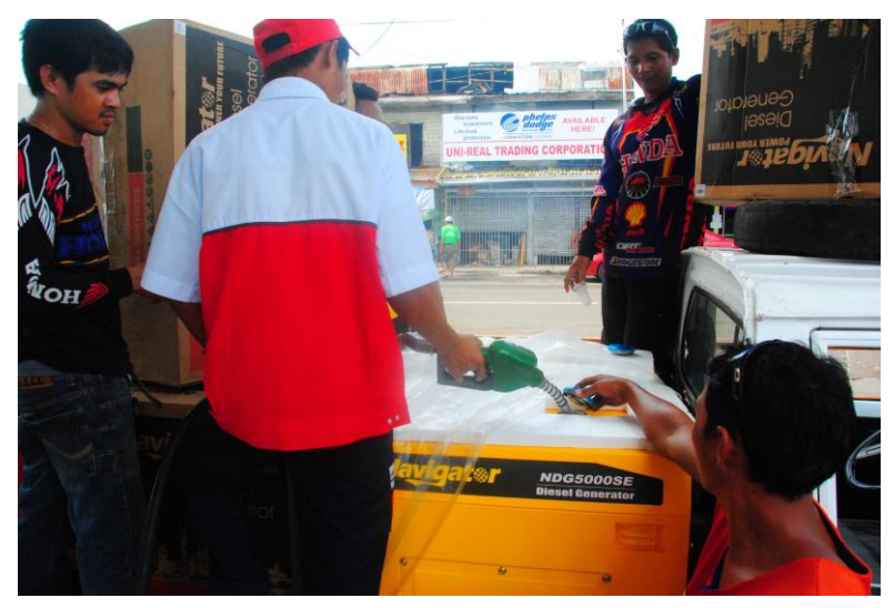
Seven power generator sets delivered to clinics in Ormoc which was without power since Typhoon Haiyan