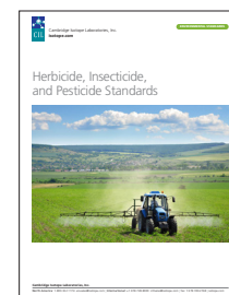
Click on the thumbnail for more information.

▼ CLICK HERE for information about our "Toxaphene Congeners."