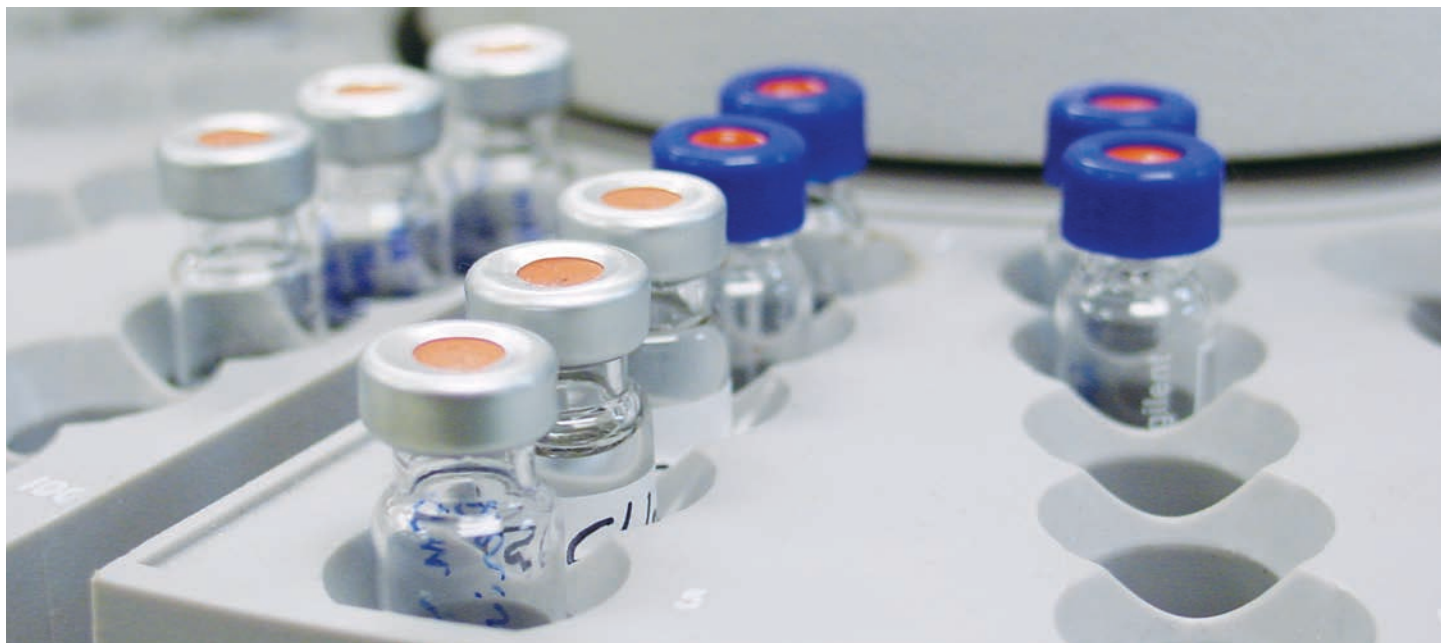
Image is for illustrative purposes only and may not be representative of actual product(s).

➤ For more information on controls in manufacturing and testing of the different grades, go to: Search → Literature → Product Quality Designations from the isotope.com home page.