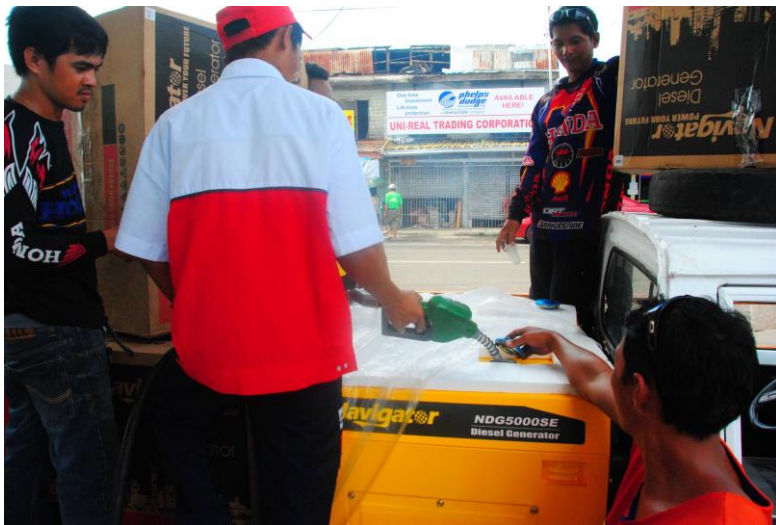
Seven power generator sets delivered to clinics in Ormoc which was without power since Typhoon Haiyan