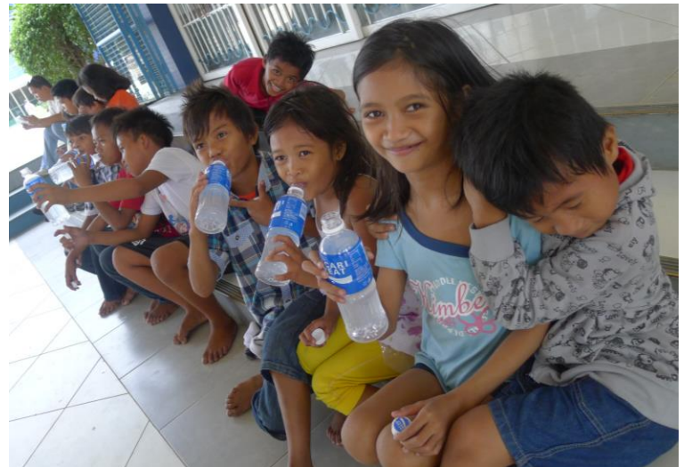
POCARI SWEAT was invaluable in the displaced people's treatment of dehydration and other illnesses where oral rehydration was essential

On November 8 th , 2013 the strongest typhoon that hit the earth landed in the Philippines. Typhoon Haiyan's wind strength at landfall beat out Hurricane Camille's, which were 305 km-per-hour winds (190 miles-per-hour winds) at landfall in the US in 1969. The aftermath was devastating, with 6,166 deaths as of January 3 rd , 2014 (National Disaster Risk Reduction and Management Council), 28,626 injured, 1,785 missing and 4 million people displaced.