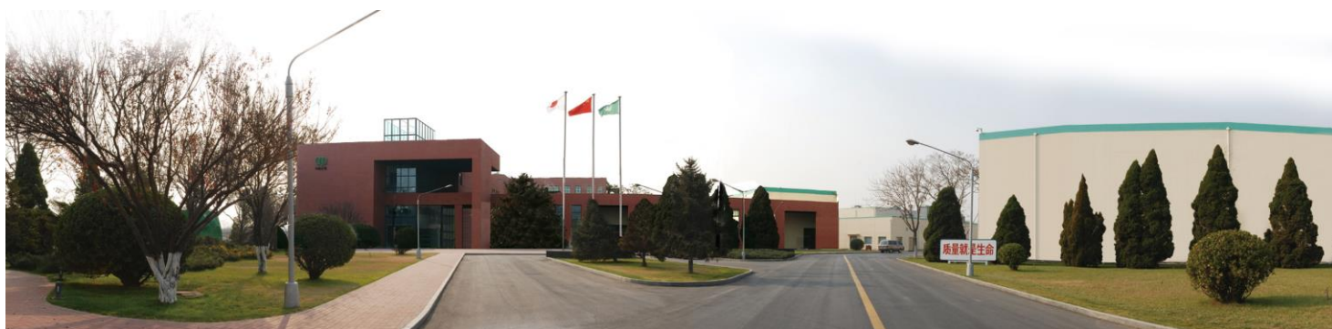
China Otsuka Pharmaceutical Co., Ltd., Tianjin, China