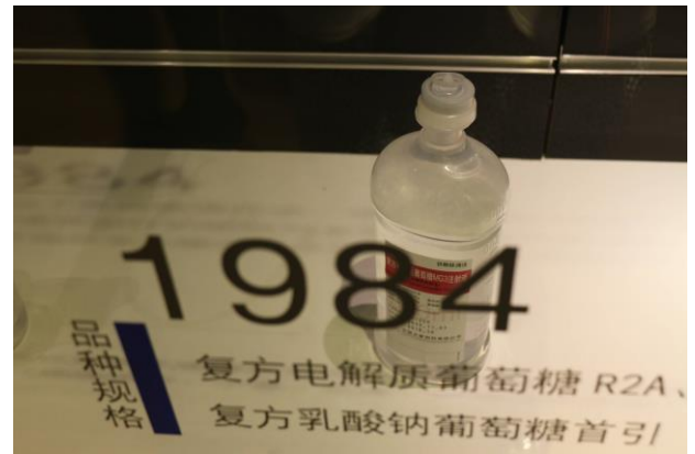
IV product produced in 1984 when the factory started operation