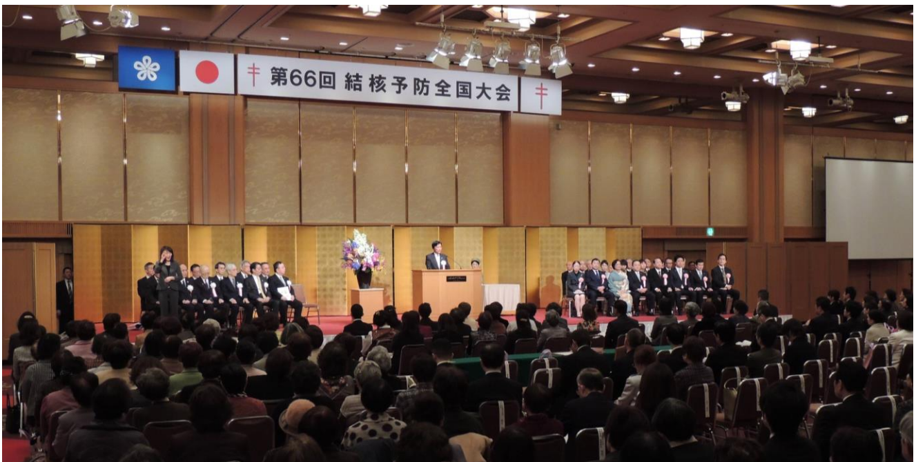
The 66th National Convention of the Japan Anti-Tuberculosis Association Award Ceremony held at Hotel Okura Fukuoka